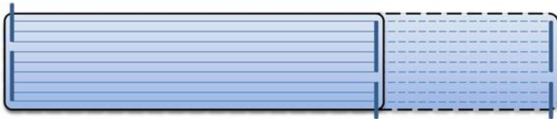
Layout of the Clear View II 1209-4567-PIC Truck Defroster

A full wire harness with the color coded connectors and installation pack with fuse make it easy to install