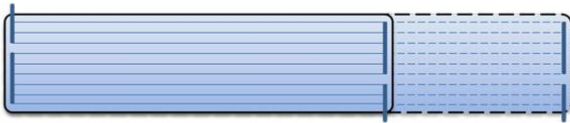
Layout of the Clear View II 1209-4567-CAP Truck Defroster

A full wire harness with the color coded connectors and installation pack with fuse make it easy to install.